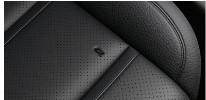
Upholstery holes larger than 1/8"