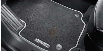
Removable stains and minor carpet wear