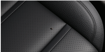
Upholstery holes smaller than 1/8"