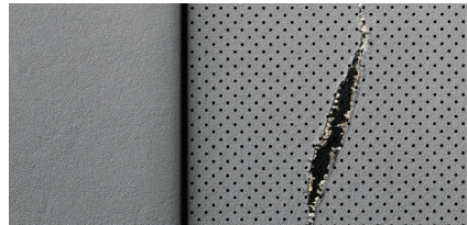
Tears larger than 1/2"