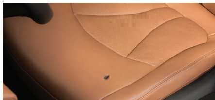
Upholstery holes more than 1/8"