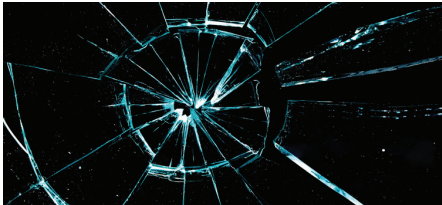
Cracked glass (equal to or more than 1/2" in diameter) or spidered cracks