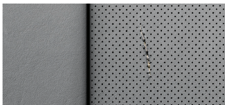
Tears equal to or less than 1/2"