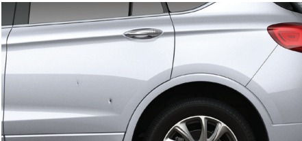
Fewer than 4 dings (less than 2") per panel

This guide and the Wear Card – along with a pre-return inspection – help identify what repairs may be needed to avoid excess wear charges.