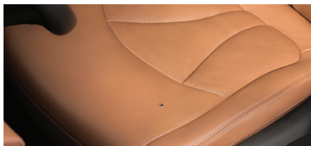
Upholstery holes equal to or less than 1/8"