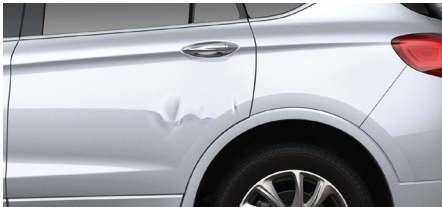
4 or more dings per panel