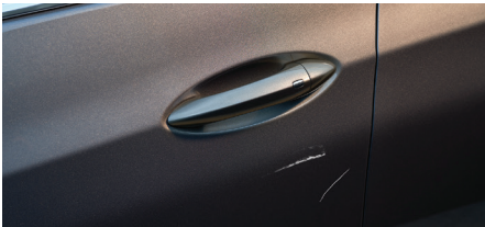
1 dent (equal to or less than 4") or 1 scratch (less than 6") per panel