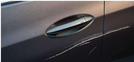
1 dent (more than 4") or 1 scratch (equal to or more than 6") per panel