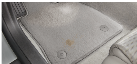
Removable stains and minor carpet wear