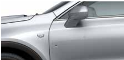
Fewer than 4 dings (less than 2”) per panel