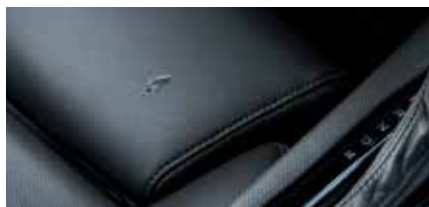
Upholstery holes larger than 1/8"