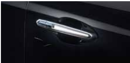
1 dent or 2 scratches (less than 4”) per panel