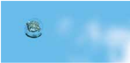
Cracked glass less than 1/2” in diameter