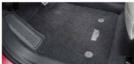
Removable stains and minor carpet wear