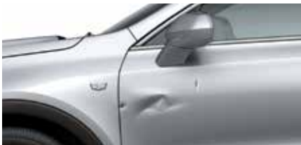
Hail damage or punctures on any panel