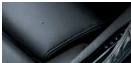
Upholstery holes smaller than 1/8"