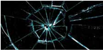
Cracked glass greater than 1/2” in diameter or spider cracks