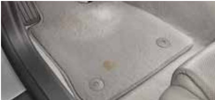
Removable stains and minor carpet wear