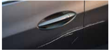
1 dent or 2 scratches (more than 4") per panel