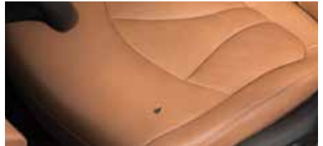
Upholstery holes larger than 1/8"