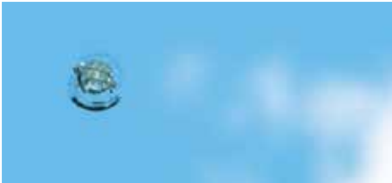
Cracked glass less than 1/2" in diameter