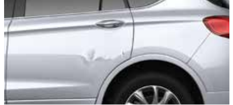
Hail damage or punctures on any panel