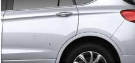
Fewer than 4 dings (less than 2") per panel