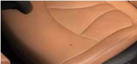
Upholstery holes smaller than 1/8"