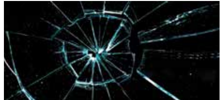
Cracked glass greater than 1/2" in diameter or spidered cracks